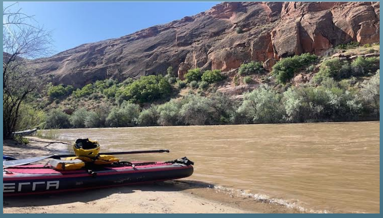
FLOW Rafting Highlights